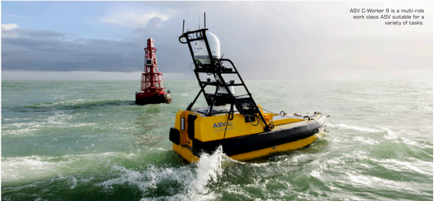
ASV C-Worker 6 is a multi-role work class ASV suitable for a variety of tasks.