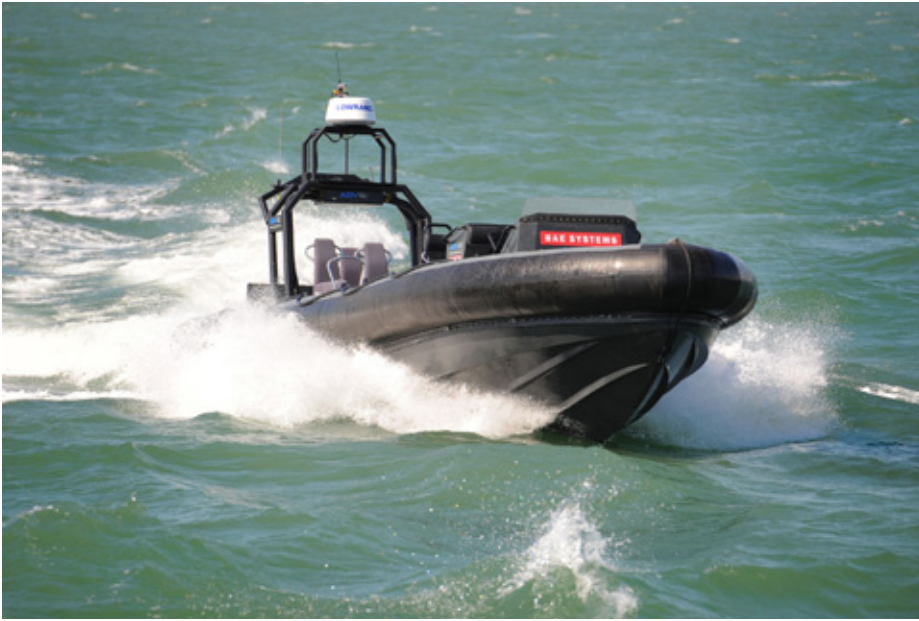
BAE Systems Unmanned RHIB with ASV Technology.