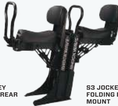
S3 JOCKEY FOLDING REAR MOUNT

This seat is shown with optional folding footrest and front handrail.