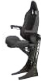
Also available with a high-back seat SW-S3-T1302