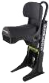
S3 JOCKEY SW-S3-2400