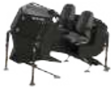
Also available without roof SW-ICE3002