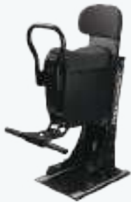
S3 JOCKEY WITH STORAGE