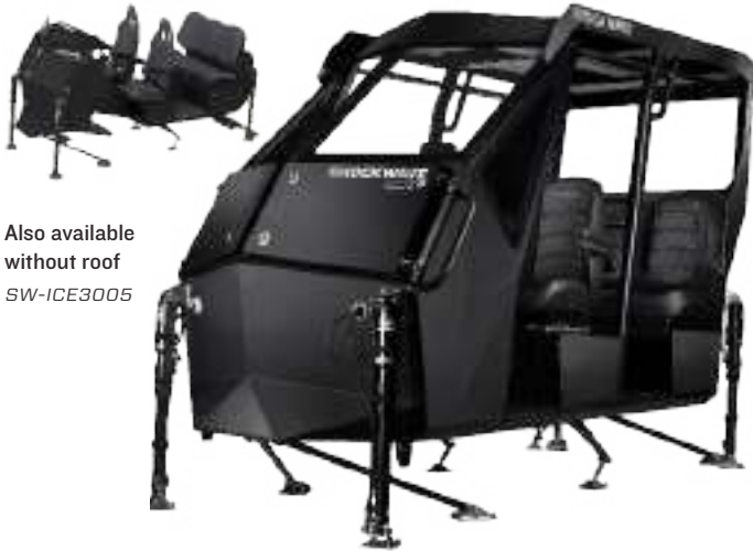
Also available without roof SW-ICE3005