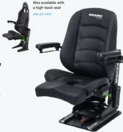
Also available with a high-back seat SW-S2-1301

This vertical drop-down seat allows the user to sit or stand while offering superior comfort in both positions. This compact and lightweight helm passenger seat is commonly used on cabin boats for moderate to heavy sea conditions.