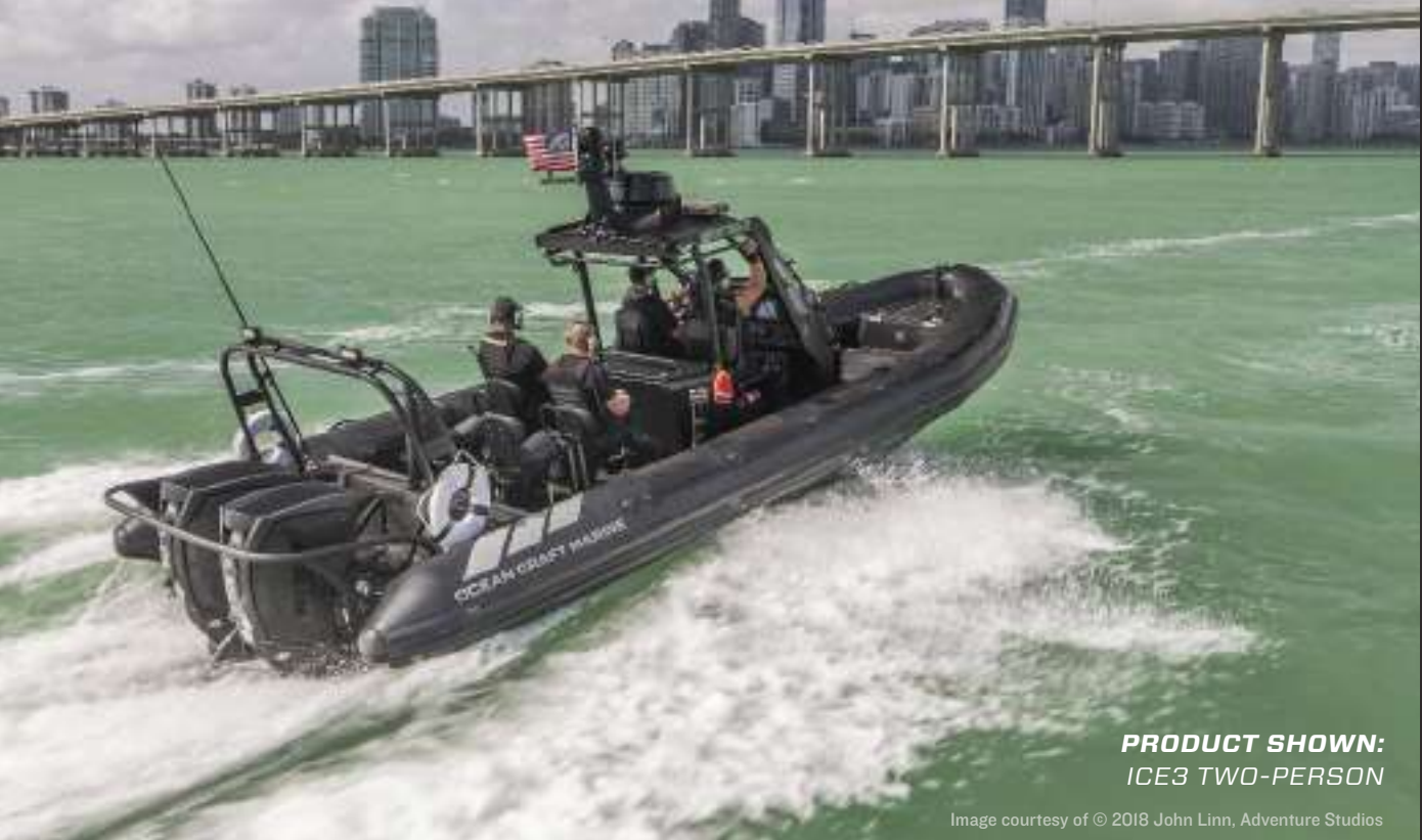
PRODUCT SHOWN: ICE3 TWO-PERSON