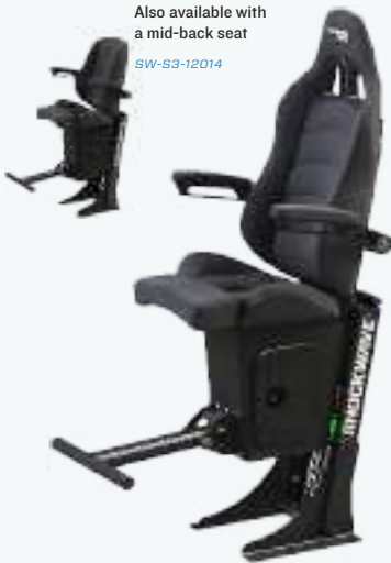
Also available with a mid-back seat SW-S3-12014