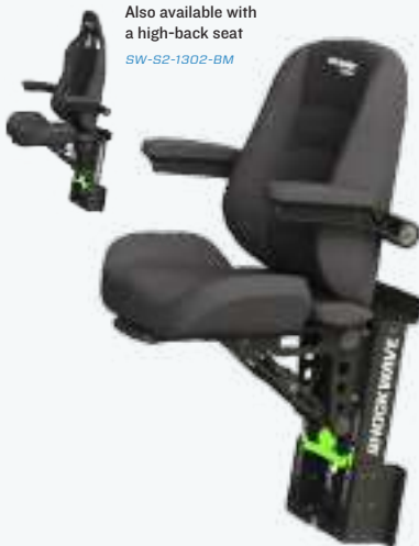
Also available with a high-back seat SW-S2-1302-BM