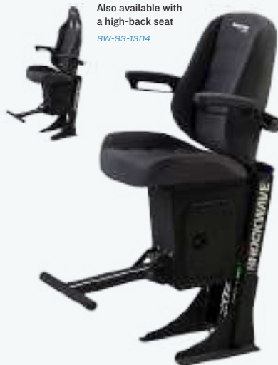
Also available with a high-back seat SW-S3-1304

This S3 solution will transform your vessel with its versatility. Boasting a flip bolster and storage, this seat is a winner. Commonly used in cabin boats for the most demanding of conditions. The storage box below is useful for stowing personal effects.