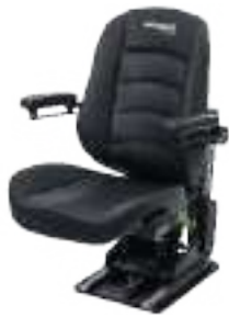
Also available with a mid-back seat SW-S2-1200